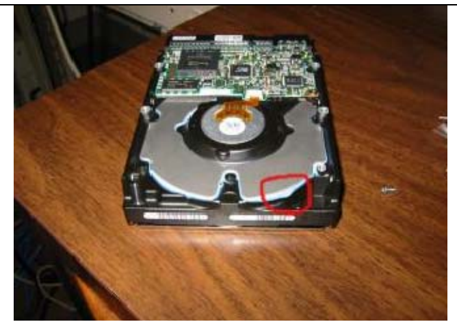
The first thing I noticed was that a blue ooze had seeped out of the bottom of the drive. At this point I was concerned that some of the goo had possibly oozed into the drive housing and onto the platters.