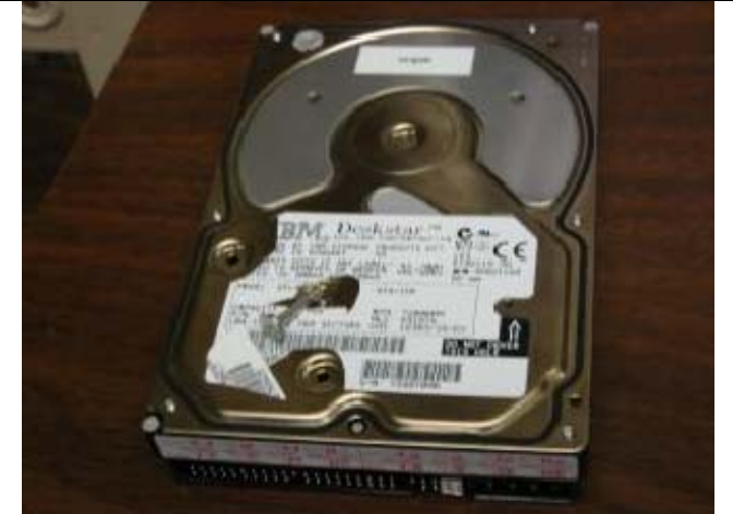
The first step was to remove the screws on the drive lid. I suspect this voided the warranty, but we were on a mission.

I had to visit a few different people before I finally found a set of torx screwdrivers in size 8. (note to self: purchase a torx 8 screwdriver from sears).