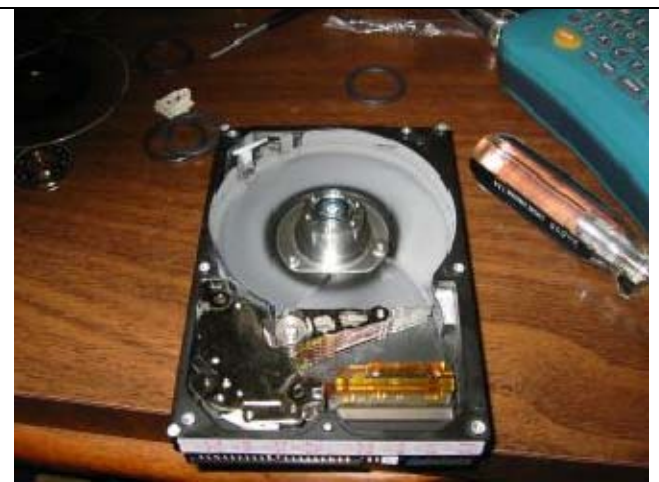
After removing all of the platters from the unit, I noticed that there sure was a large amount of dust inside of the drive housing.