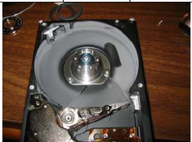
Here's another close-up of the inside of the drive housing. I had wiped my finger on the inside of the housing before shooting this picture.