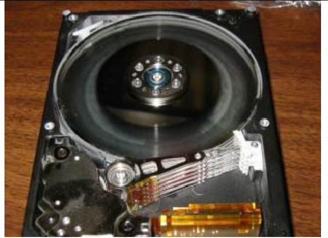
I wondered where all of that dust came from, and then I saw the platters. That's odd, I've never seen see through platters before.