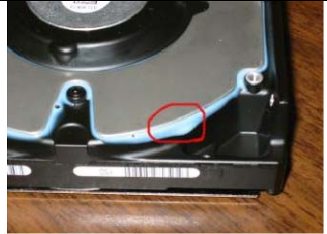
Here is a closeup shot of the drive with the blue goo.

Yesterday, on April 21st 2003, we finally had the opportunity to open up the drive and determine the extent of the failure. This is a documentary of what we found.