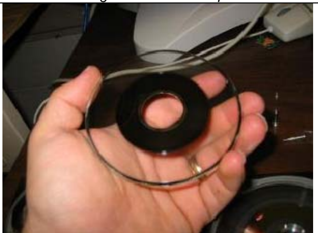
After popping out the first platter I realized that I was correct. The drive platter was now see through. It appears that the head crash scrubbed the drive so clean that the magnetic substrate has been wiped clean off the platters.