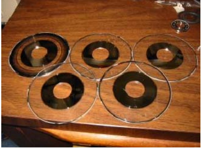
The damage wasn't limited to just one or two platters. All five of the platters received some level of surface wiping.